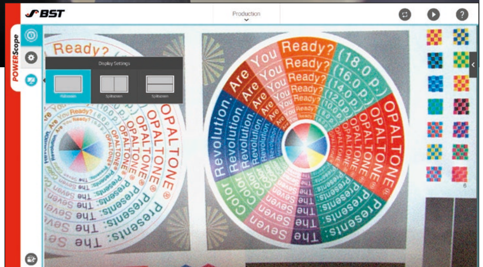
The intuitive POWERScope 5000 touch screen user interface "Production Display Settings Menu".